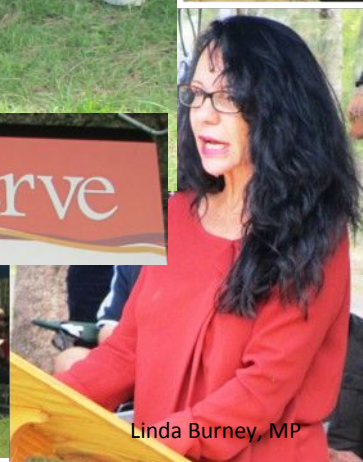
Linda Burney, MP